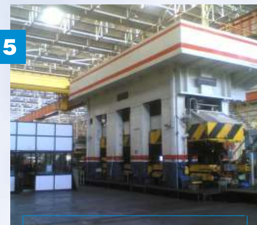
5000 T , Frame Side Member Press - ASHOK LEYLAND , Hosur

Complete Erection and Commissioning of the Press along with our principles and Production Support