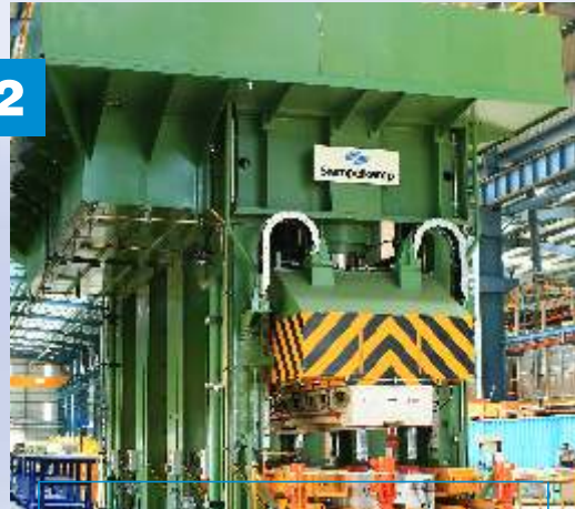
5000 T , Frame Side Member Press - KLT , Daimler , Chennai

Erection and Commissioning of the Complete Press along with our principles and Production Support