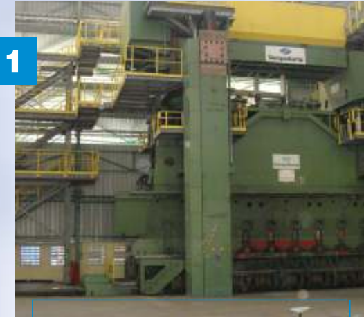
8000 T , Plate Bending Hydraulic Press - BHEL , Trichy

Erection and Commissioning of the Complete Press along with our principles and Production Support