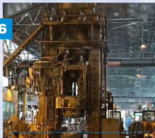
6300 T / 1200 T , Wheel Forging Press - SAIL , DSP , Durgapur

Upgradation of PLC and Software Programme of the Press along with our principles.