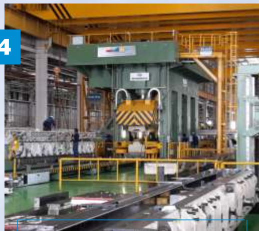
5000 T , Frame Side Member Press - MSGI , Daimler , Chennai

Changing of Main Cylinder Piston Rods and Changing of Moving Beam (100 Tons)