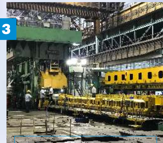
5000 T , Frame Side Member Press - TATA MOTORS , Jamshedpur

Complete Erection and Commissioning of the Press along with our principles and Production Support